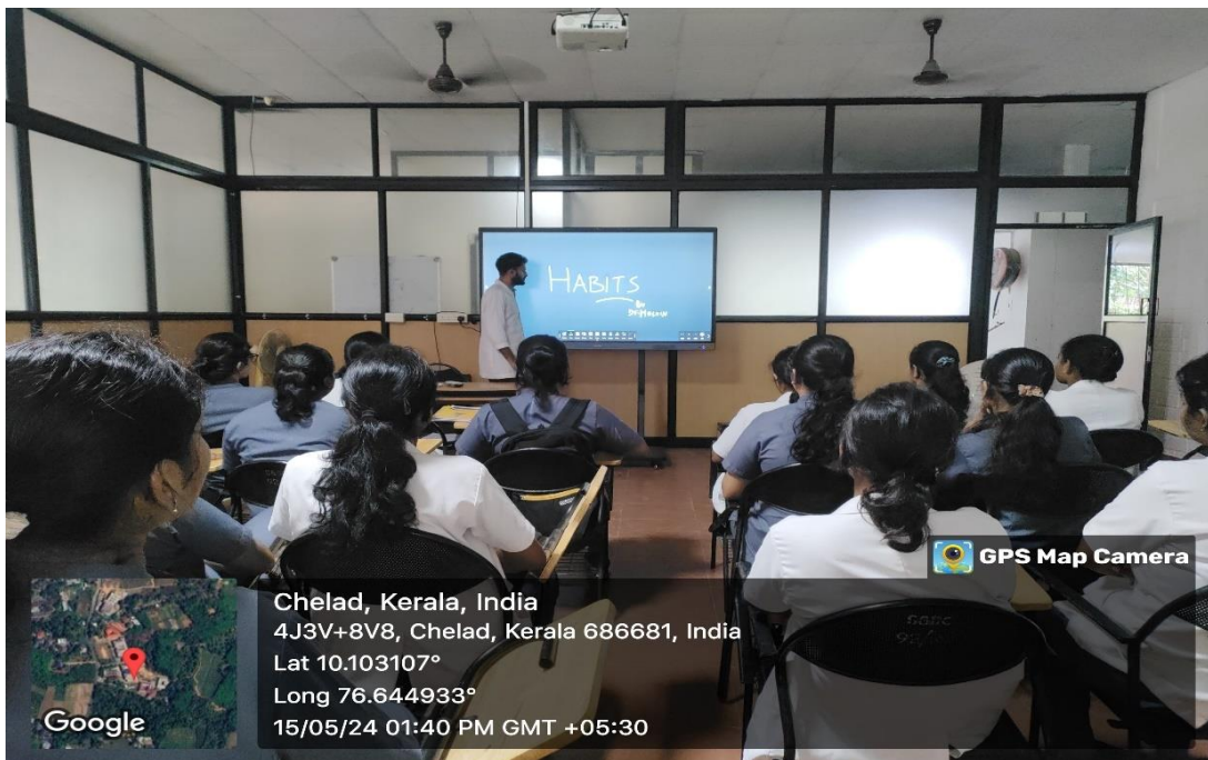
LECTURE HALL 3

(AFFILIATED TO KERALA UNIVERSITY OF HEALTH SCIENCES)