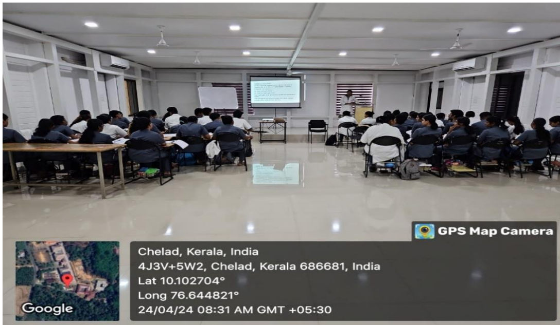
LECTURE HALL 4