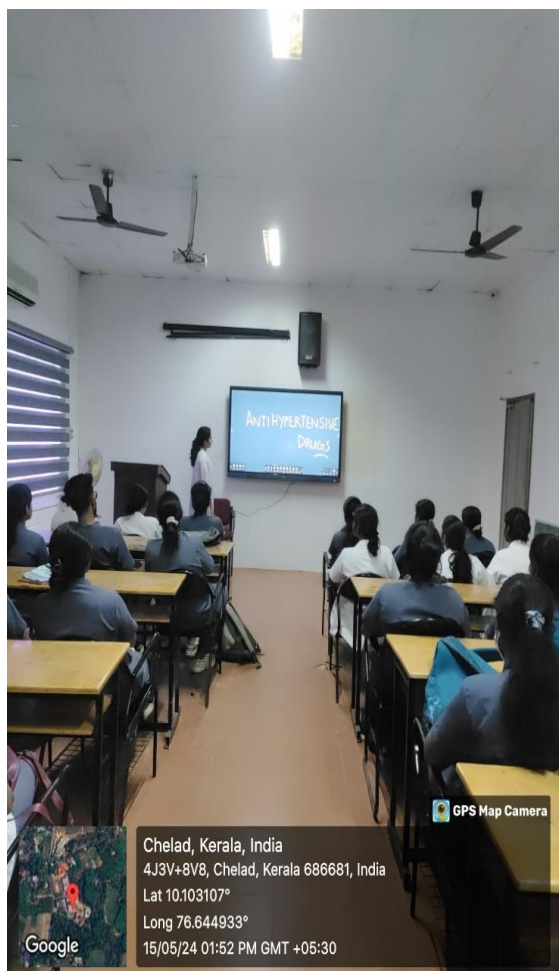
LECTURE HALL 1

(AFFILIATED TO KERALA UNIVERSITY OF HEALTH SCIENCES)