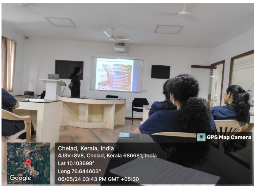
SEMINAR HALL IN DEPARTMENT OF CONSERVATIVE DENTISTRY & ENDODONTICS

Phone : 0485-2572531, 532, 9188952016, 9188952017