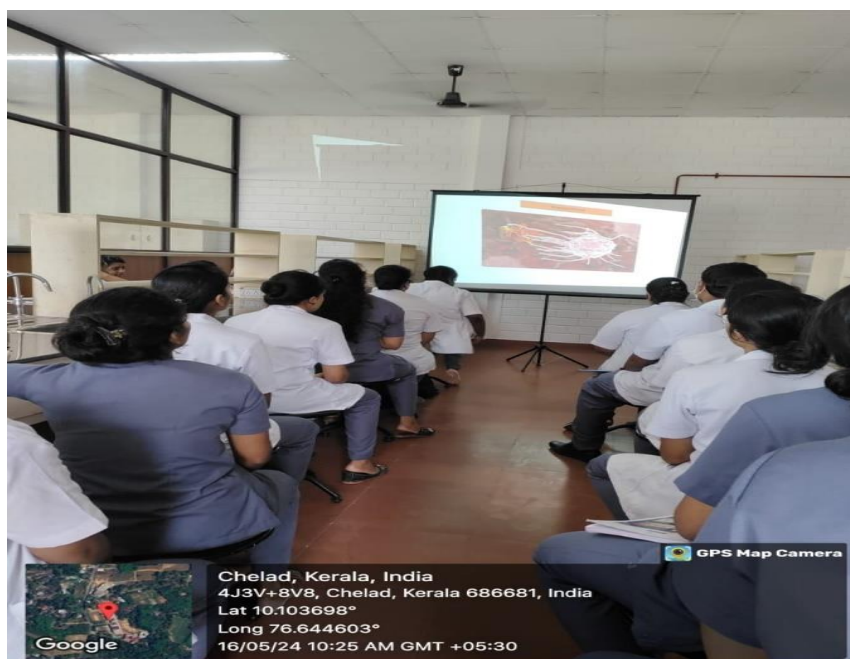
GENERAL PATHOLOGY LAB

Phone : 0485-2572531, 532, 9188952016, 9188952017