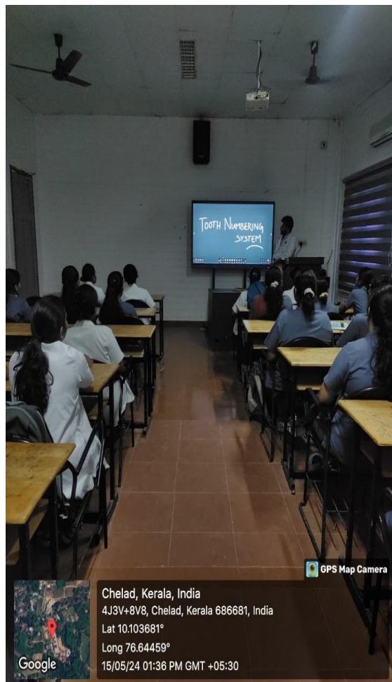
LECTURE HALL 2