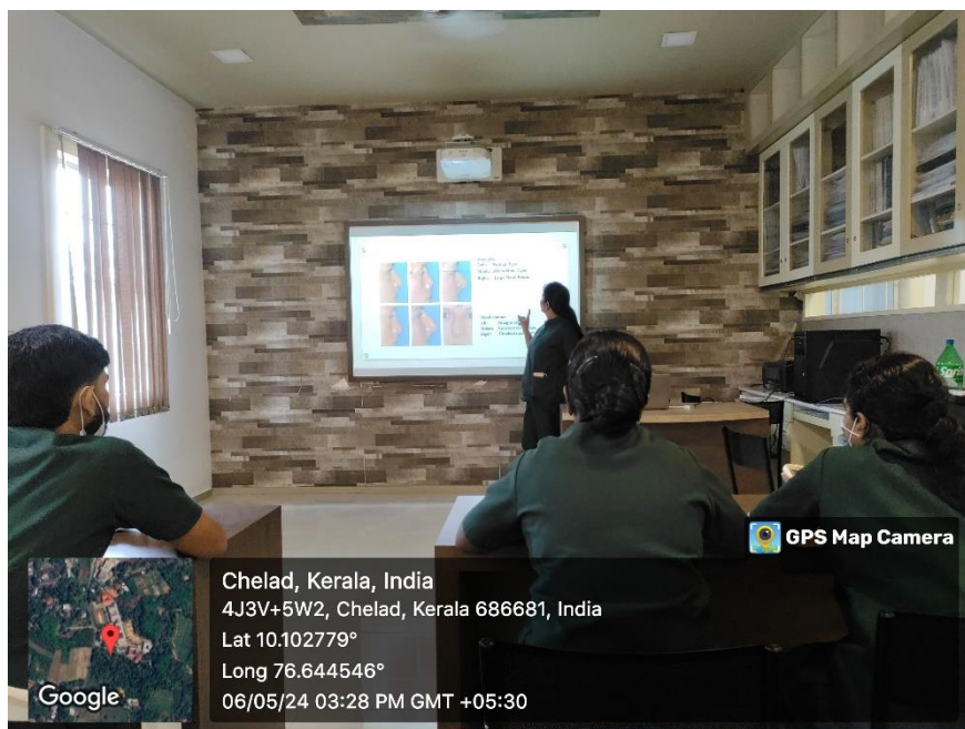
SEMINAR HALL IN DEPARTMENT OF PROSTHODONTICS

(AFFILIATED TO KERALA UNIVERSITY OF HEALTH SCIENCES)