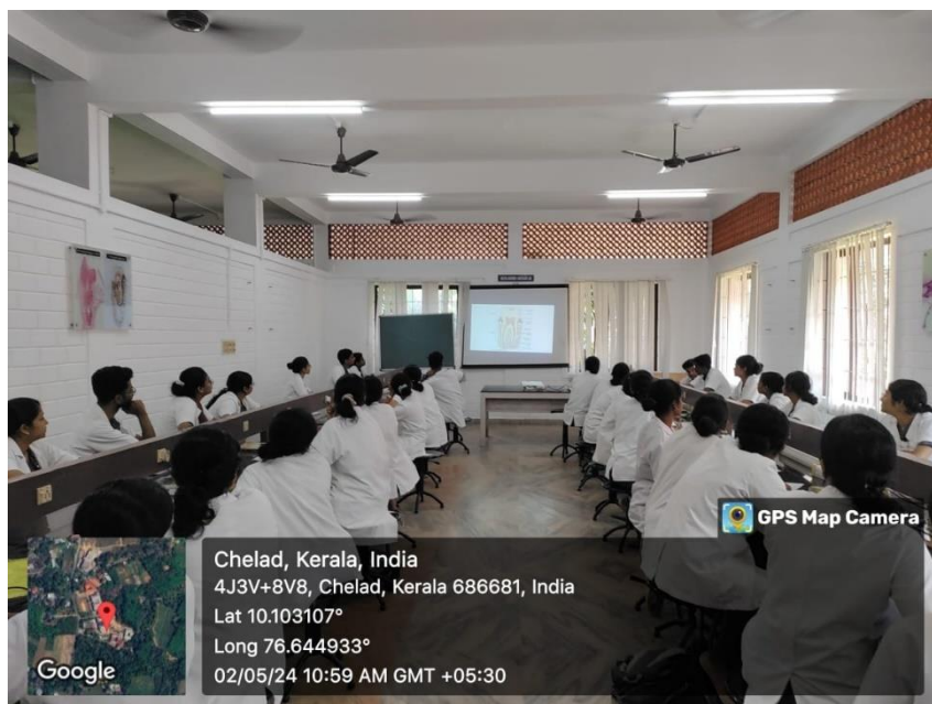
DENTAL ANATOMY AND HISTOLOGY LAB

(AFFILIATED TO KERALA UNIVERSITY OF HEALTH SCIENCES)